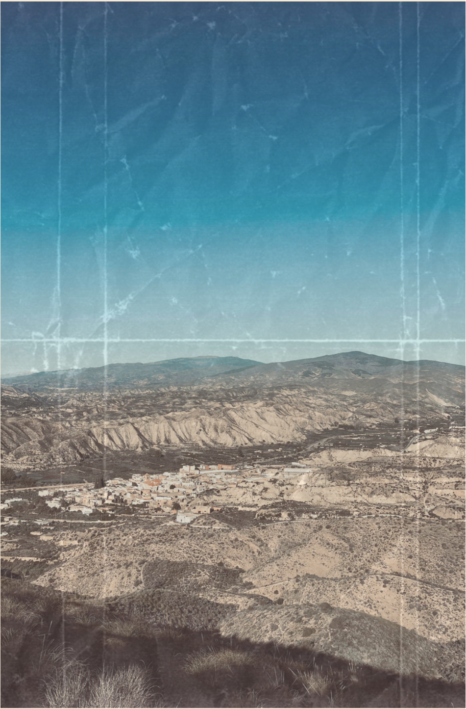
Views of the town of Alhabia